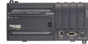
DO-06DD2-D $199.00 DC in/DC out/DC supply