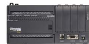
DO-06DA $259.00 DC in/AC out/AC supply