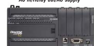
DO-06AA $275.00 AC in/AC out/AC supply