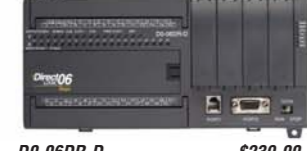
DO-06DR-D $239.00 DC in/Relay out/DC supply