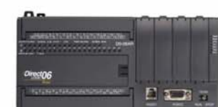
DO-06AR $259.00 AC in/Relay out/AC supply