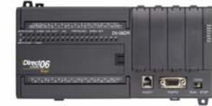
DO-06DR $229.00 DC in/Relay out/AC supply