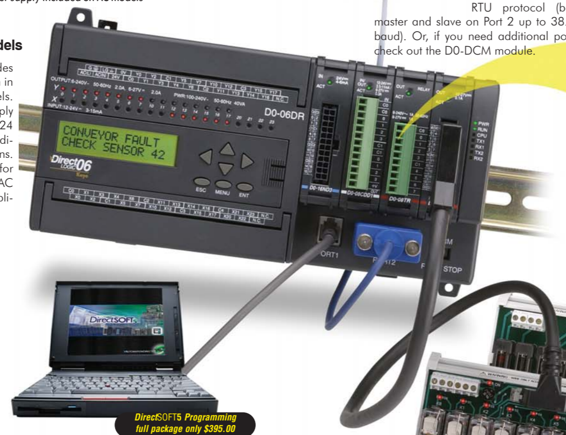
DirectSOFT5 Programming full package only $395.00