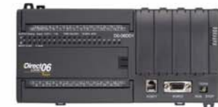
DO-06DD1 $199.00 DC in/DC out/AC supply

Check out the top six reasons why the DL06 is a great fit for discrete applications: