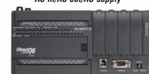
DO-06DD1-D $199.00 DC in/DC out/DC supply