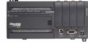
DO-06DD2 $199.00 DC in/DC out/AC supply